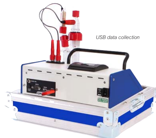
USB data collection

This is a windows application that allows you to view and print sets of results created by the Aquamax KF Titrator. It can download results directly from the instrument via a serial port connection, or open result files previously saved to disk. The Results Manager package contains all necessary cables, connections, installation cd and user manual.